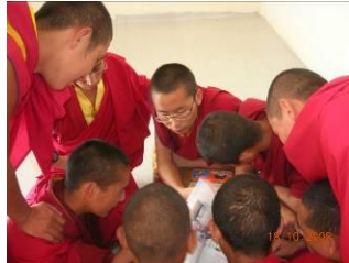
What is in the news?