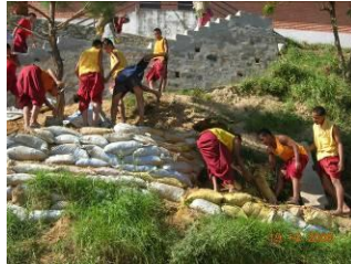
Greening our environment