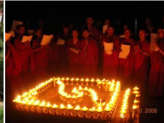
Butter lamps offering