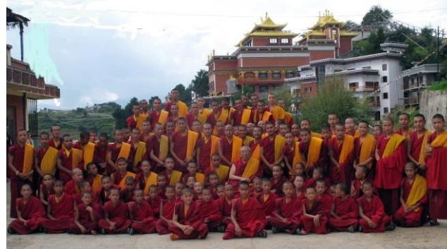
Teachers and students with Thrangu Rinpoche

However some of our school facilities are in dire need of upgrading. For instance, some of our computers are still running on Windows 97. The photocopying machine needs upkeep and maintenance. New library materials such as library books and educational DVDs are necessary. Our sports equipment has to be replaced. We are also in need of dharma musical instruments used for practise. These are some of the facilities we wish to raise fund for.