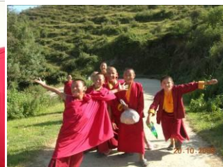
We are going to a picnic!