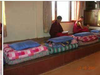
A corner of our room