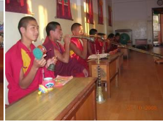
Using the ritual instruments